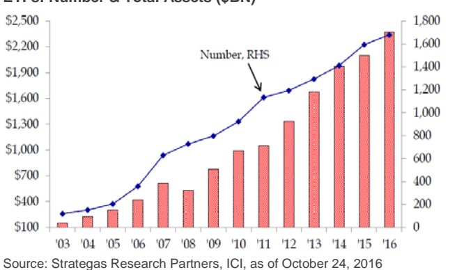
Exhibit 1: ETF assets have experienced exponential growth ETFs: Number & Total Assets ($BN)

Exhibit 2: Passive mutual funds are accumulating larger stakes in more big companies, often collectively exceeding the holdings of actively managed funds.