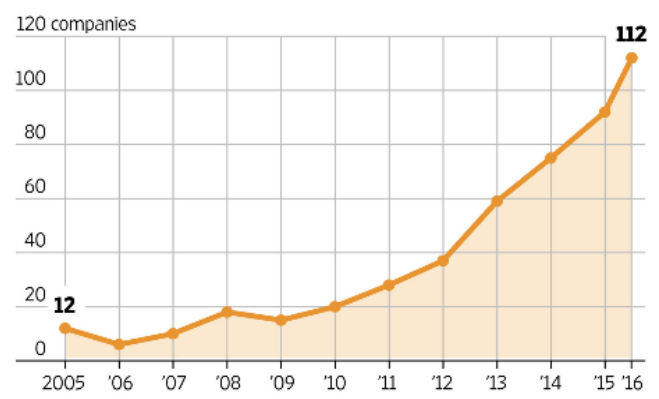
Note: Applies to total market value of share classes included in the S&P 500. All figures as of year-end except for 2016, which is as of June 30.

According to a study by Leuthold Research, analyzing the last 25 years of market data, during periods of time when passive funds outperformed active, the average annual rate of return for the S&P 500 was 18% per annum. We saw this type of market strength in the late 90's and we have seen a similar market for the last 7 years. In contrast, during periods of time when active outperformed passive, the average annual rate of return for the S&P 500 was +6% per annum. We are not calling for a bear market, but we do expect modest returns going forward because the stock market has